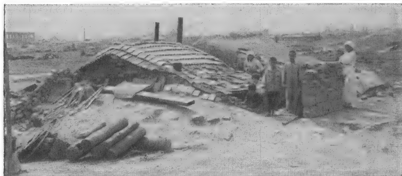
Makeshift homes in Sinychu